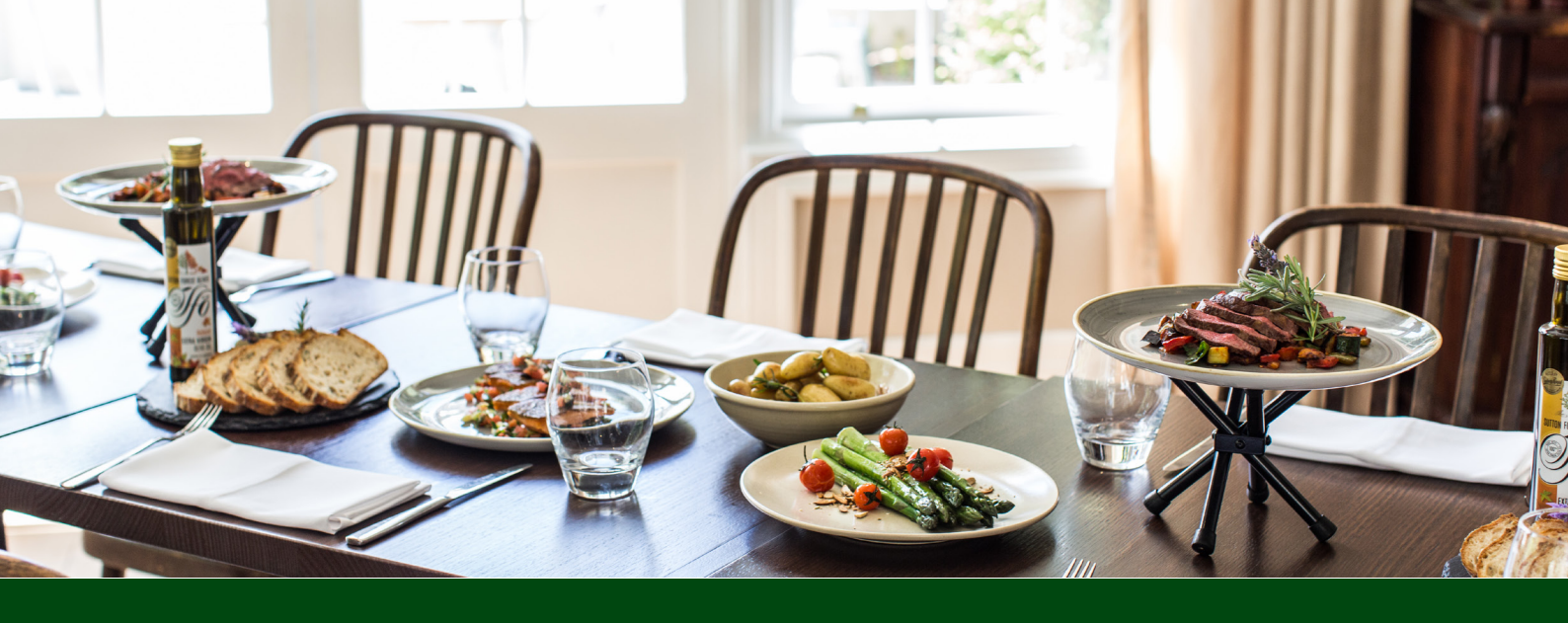
TABLE SHARE FEAST DINNER MENU