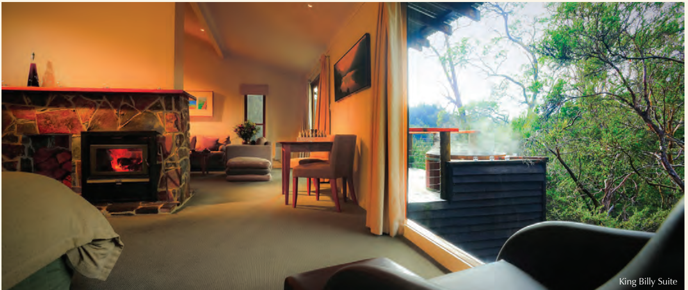
King Billy Suite