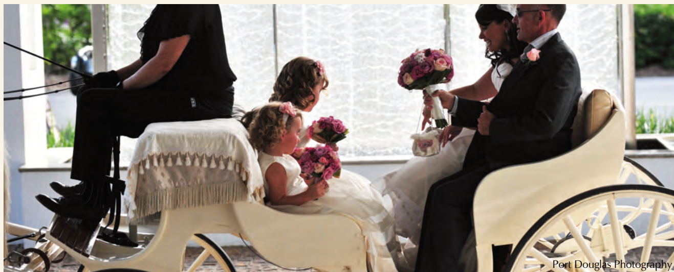
Port Douglas Photography