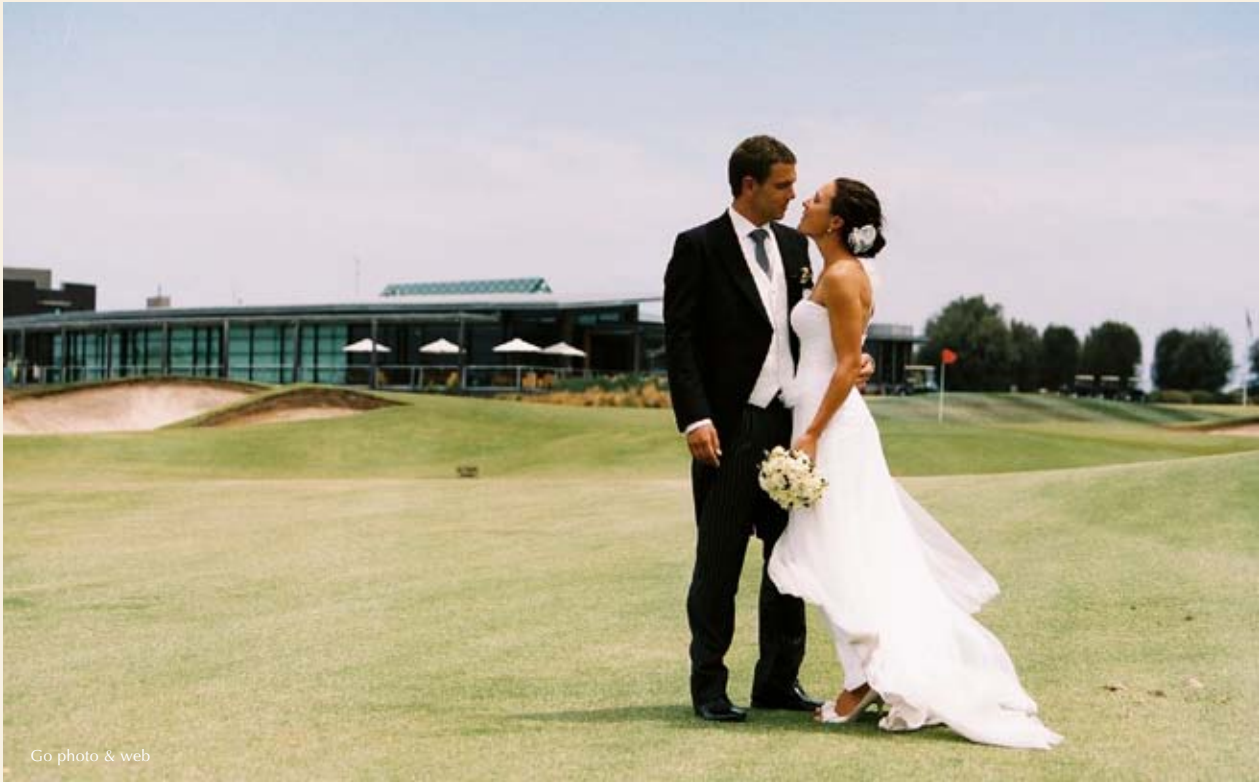
Go photo & web